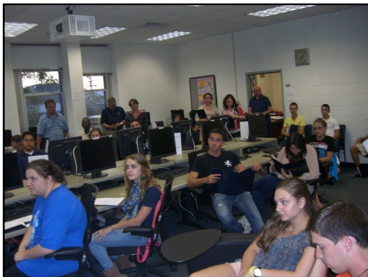
Students attend the first e-Portfolio meeting