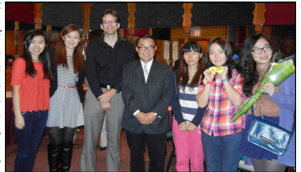
Students and faculty at the Asian Studies Department Luncheon