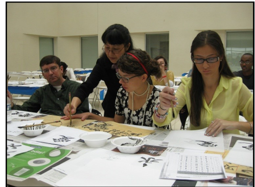
Chinese International Month events on campus