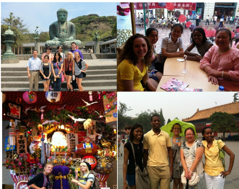
SHU in Japan