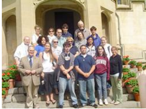
Oxford, July 2007

For more information please see PDF... click here