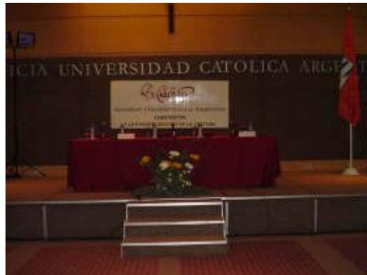
Universidad Catolica Argentina, Buenos Aires, Argentina

For more information please see PDF... click here