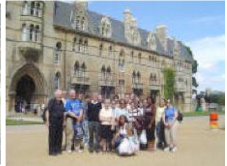
Group visit to Christ Church College, Oxford