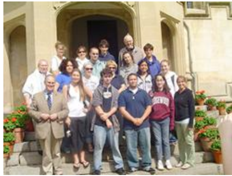
Oxford, July 2007

For more information please see PDF... click here