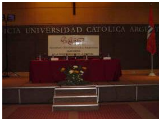
Universidad Catolica Argentina, Buenos Aires, Argentina

For more information please see PDF... click here