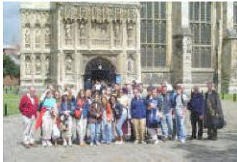
Group visit to Canterbury Cathedral

July 26 - August 9, 2005 (Brochure - PDF) For more information please see... Course Overview & Reading List