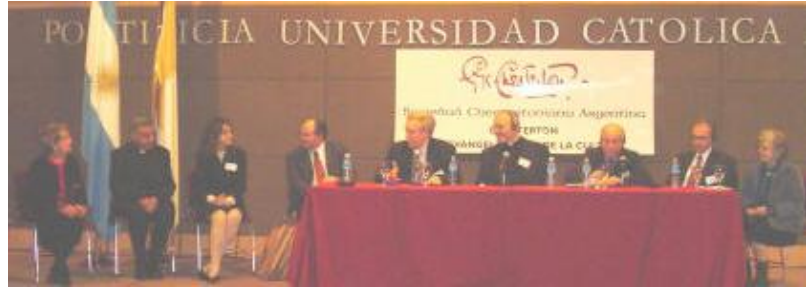
Panel Discussion at the Catholic University of Argentina Buenos Aires, Argentina

For more information: sociedadchestertonianaargentina.org Event Program (PDF)