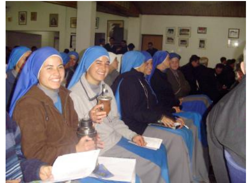
Sister of the Congregation of the Incarnate Word, San Rafael, Argentina