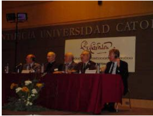
Opening of the Conference