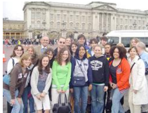
Buckingham Palace, June 2007